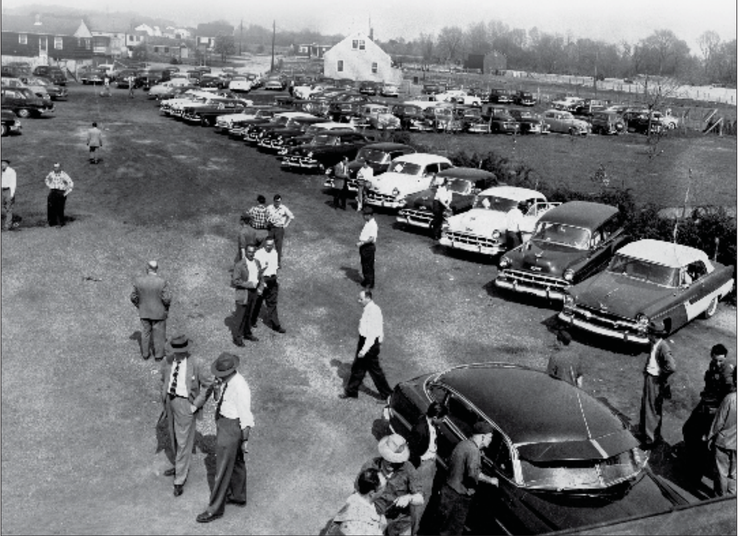
1955 • 81 South Main St. • East Windsor, CT