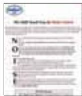
A 2012 email appeal to members

After a bill is filed it is assigned to a committee. The committee holds a public hearing and sometimes assigns the bill to a sub-committee to work on the bill afterwards. Ultimately the committee makes a recommenda-